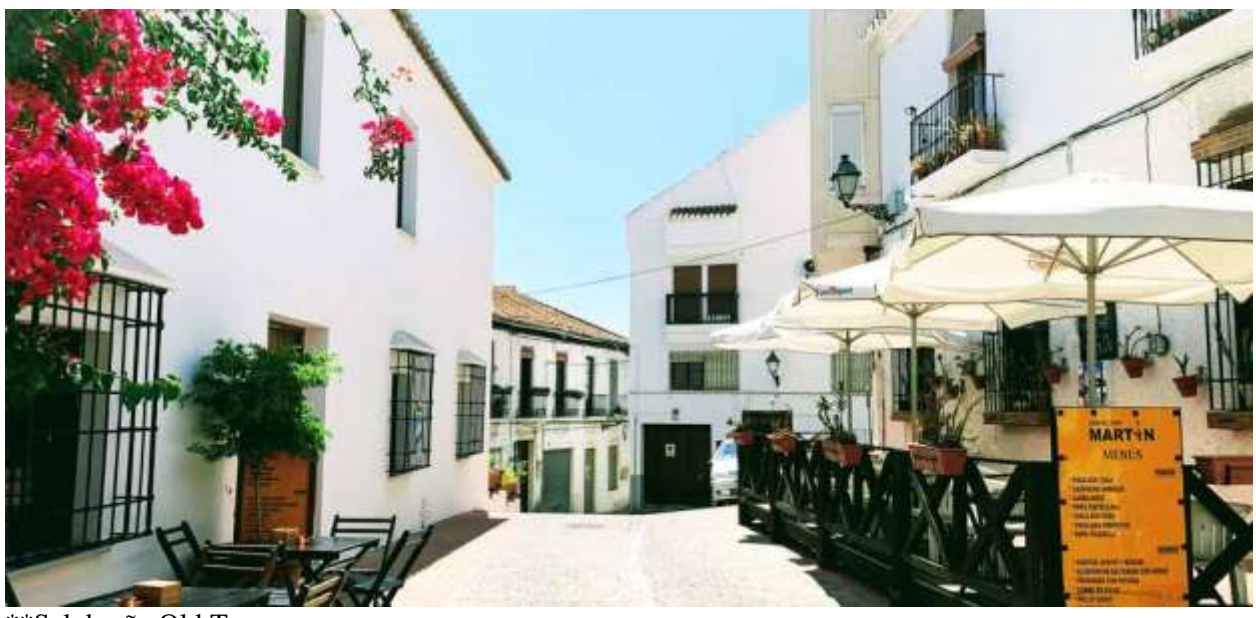
**Salobreña Old Town

From the Mirador "El Postigo", make your way down the street away from the Paseo de las Flores. As you round the corner there will be a quaint little cafe on your right. This is a great place to stop and have a snack and a cool drink. The area around the cafe is beautiful.