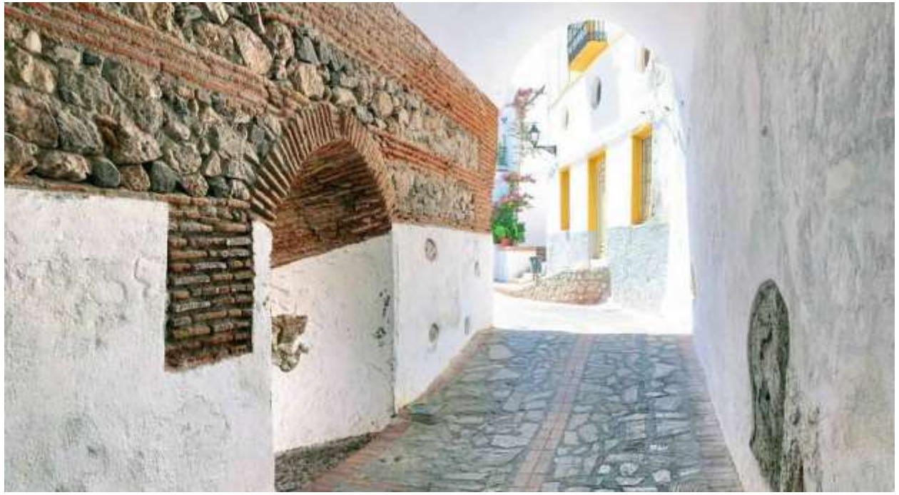
** La Boveda