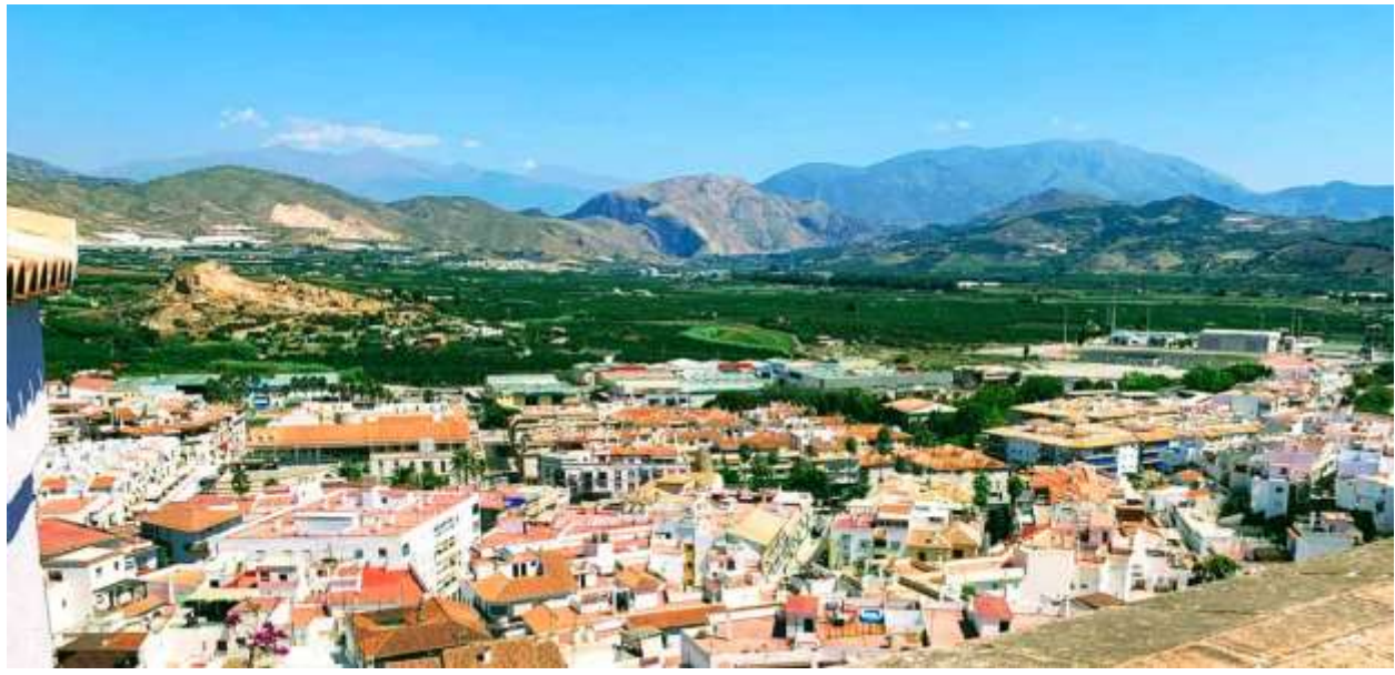
** View from El Mirador Postigo

At that time, it was called "Postigo del Mar", which means "Door to the Sea". It was given this name because the gate led from the village center to the port and beaches below.