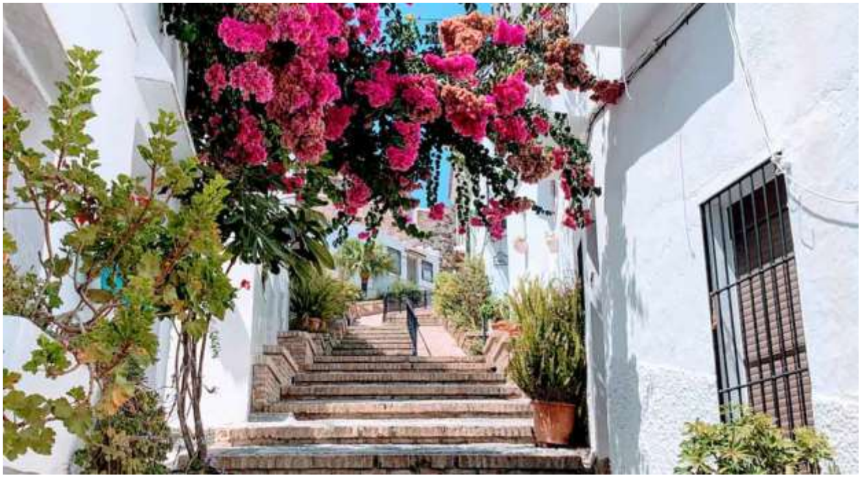
**Salobreña Old Town

It is a sight not to be missed! ... So, let's go!