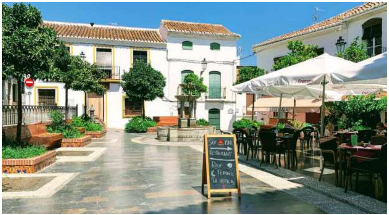
** Plaza del Antiguo Ayuntamiento

This is where our tour ends, but there is still much more to see... Continue reading below to learn about other important sites in Salobreña and where to find them.