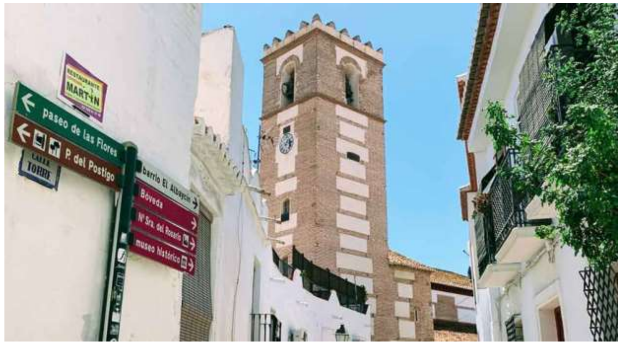
** Iglesia de Nuestra Señora del Rosario in Salobreña

Walk around the church and enjoy the beautiful views from the terrace towards the sea. From there, walk along the side of the church and down the steps, take a right and you will find the next site on our tour, "La Boveda".