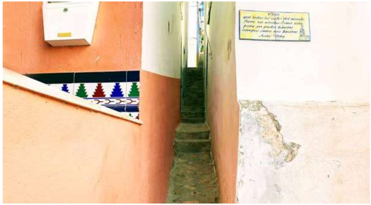
** La Calle Mas Estrecha