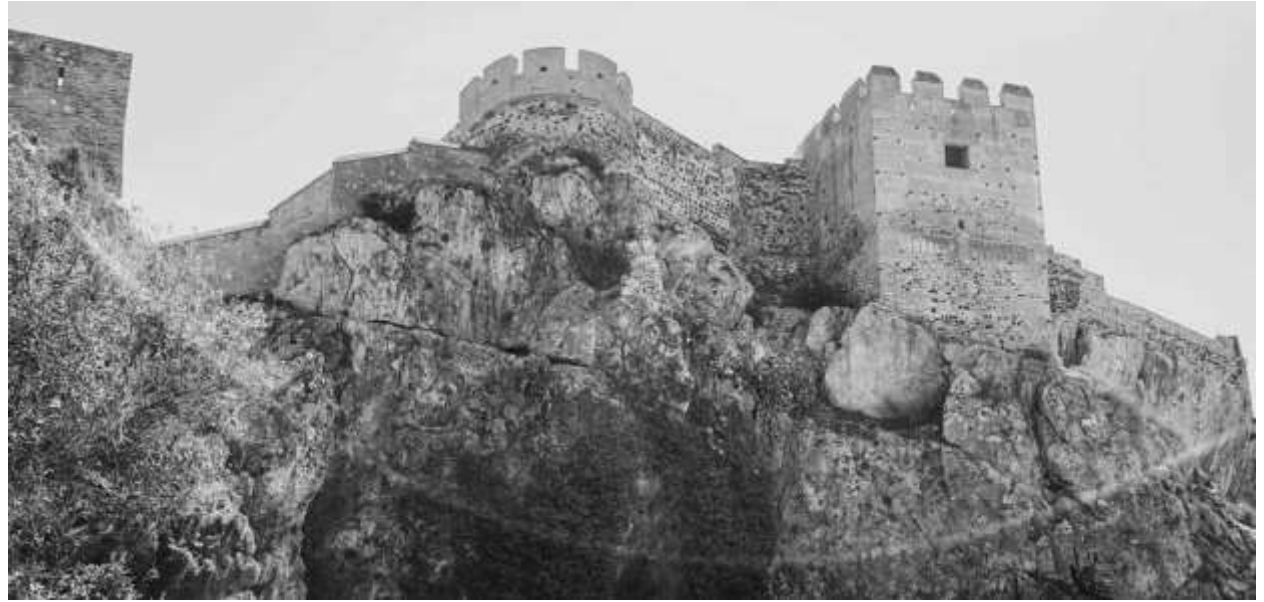
** View of the Salobreña castle from the Paseo de las Flores

Read the <u>Salobreña Castle</u> Guide for more information.