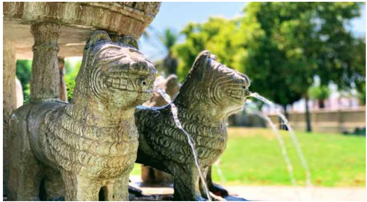
** Fountain in Parque La Fuente in Salobreña