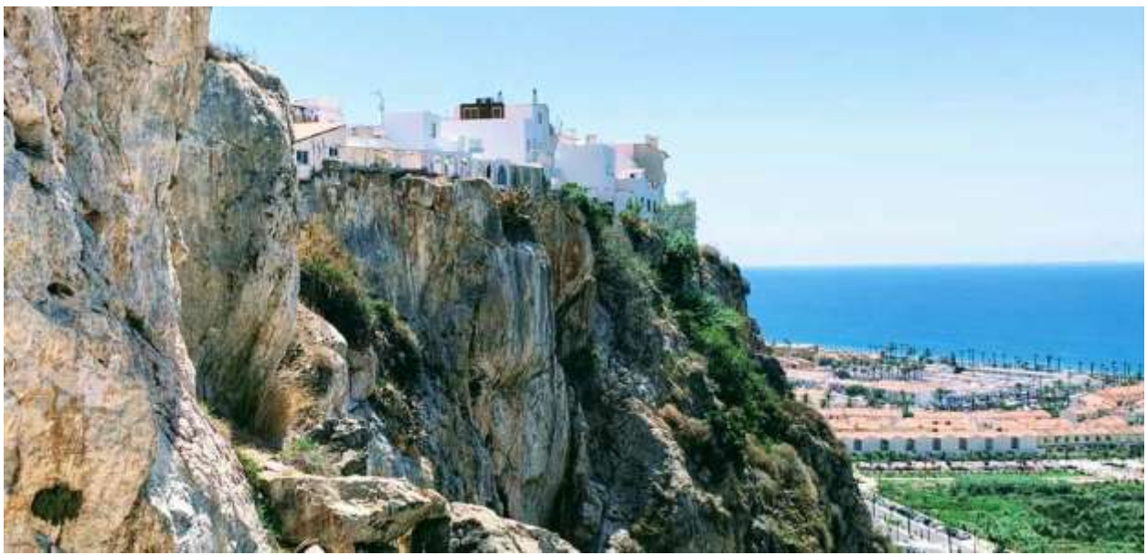
** View of the houses upon the Salobreña Crag from the Paseo de las Flores

Take a stroll around the super-sized patio and enjoy the incredible views of the sea and impressive castle towering above.